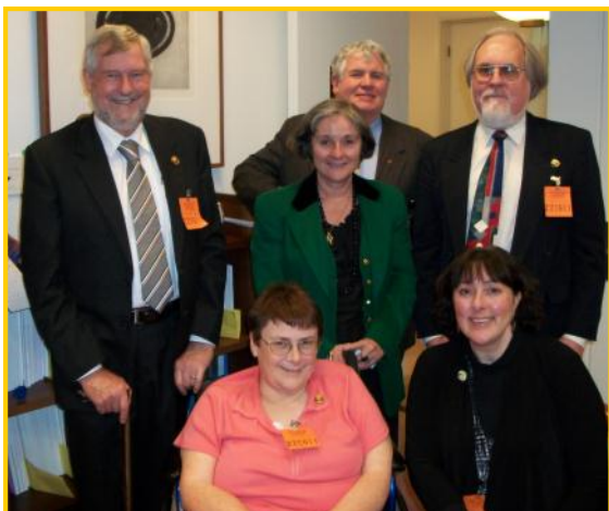
Delegation with Senator Claire Moore

Polio Australia is grateful for the support provided by our Parliamentary Patrons: Mark Coulton, Jill Hall, Greg Hunt, and Catherine King; as well as the growing number of Parliamentary Friends of Polio Survivors.