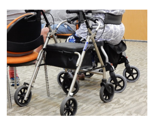
More photos at <a href="www.polioaustralia.org.au/retreat-2017/">www.polioaustralia.org.au/retreat-2017/</a>