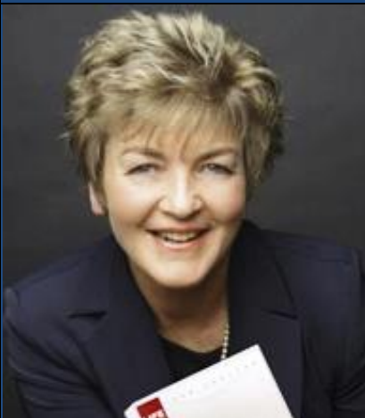
Age Is An Attitude

Reverse Garbage is a creative reuse centre making a difference in the world by reducing waste and creating change in the way we look at resources. We inspire and support kids, adults, artists and teachers to consume less, make more, save money – and feel good doing it!