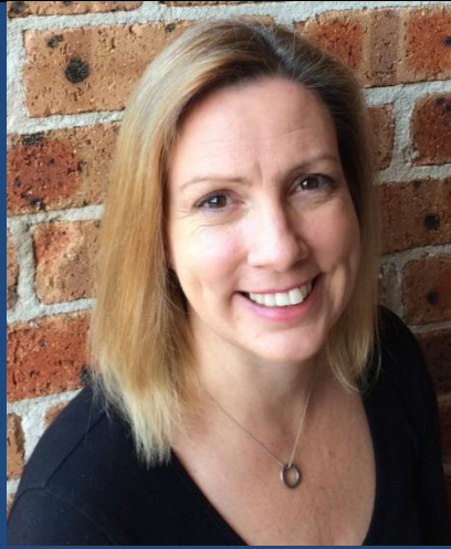
Achieving Your Goals By Effective Pacing, Grading And A Little Assistive Technology