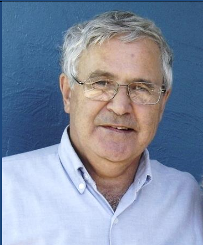
The Spread of Buddhism

Personal opportunities of development via Bachelor of Education, Advanced Certificate in Counselling, Grief and Loss Trainer, as well as leadership experience, has enabled her to share widely and learn from participants.