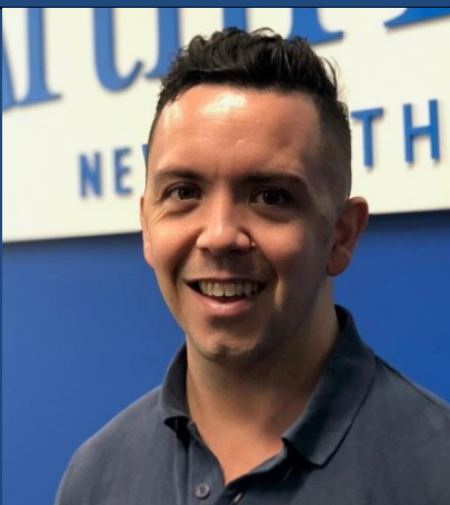
Arthritis: Pain Management, Complementary Medication and Alternative Approaches