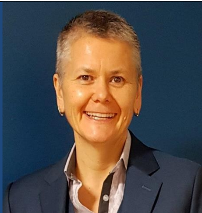
Diet, Immunity And Inflammation