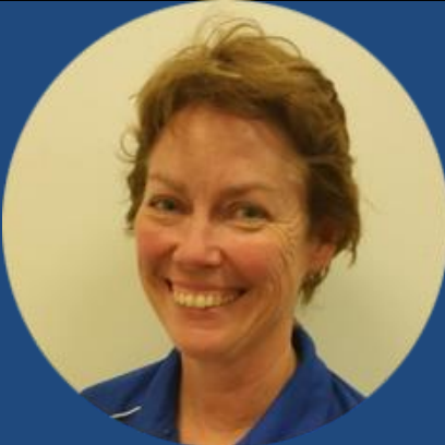
Living With Polio: Looking After Your Shoulders

25 years on she is still proud to be an Occupational Therapist, driven to provide a personal and compassionate service. Her aim is to equip each client with the skills they need to be the most independent, fulfilled and amazing version of themselves regardless of the circumstances they find themselves in.