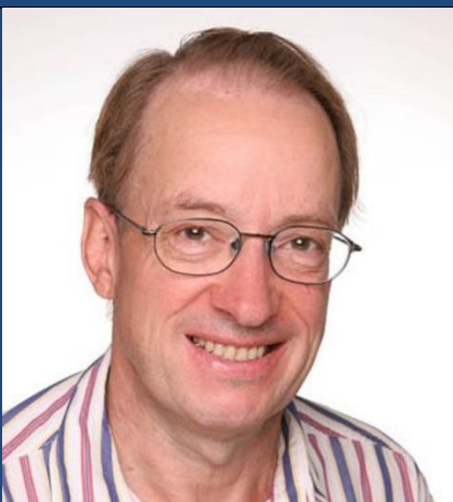
Humanism: An Enlightened Life Stance