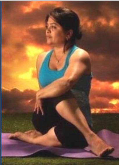
Seated Yoga Therapy