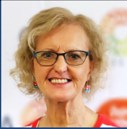
Universal Design, Accessibility, And Inclusion