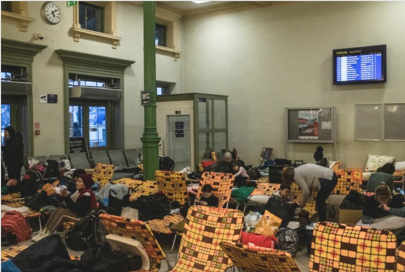
Reception center for Ukrainian refugees at the main railway station in Przemyśl, Poland, on Feb. 27.